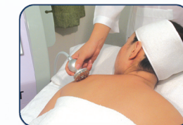
Face and Body High Pressure Oxygen Infusion