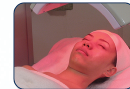
LED panel with 12 Oxygen Nozzles

Our ambient air is made up of approximately 21% oxygen, 78% nitrogen and about 1% argon and some other trace gases. The Oxylight oxygen concentrator extracts the oxygen from room air, scrubs or bypasses the other gases and moisture, accumulates the oxygen and thus provides a continuous stream of highly concentrated oxygen.